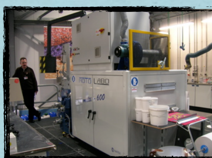
Pilot-coating machine for fabric treatments